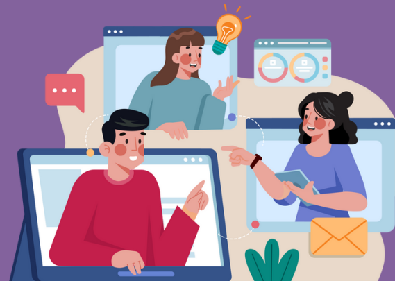
CIVIL SOCIETY CONNECTIONS