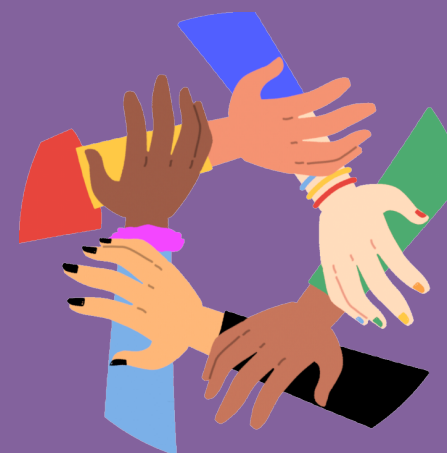
LEVELS OF ENGAGEMENT